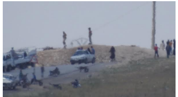
Photo: FSA militants on their position north of Menbij

The Turkish government has led this onslaught in order to crush the YPG Kurds and block their access to the Mediterranean Sea. They consider the Kurds a threat to Turkish security and have no regard for the Christians or Yezidis there. The Turkish government also supports the FSA against the Syrian government and Afrin has become a base for the FSA. A new reign of terror has descended over Afrin. Joint Turkish and FSA attacks have swept over 200,000 Kurds, as well as 35,000 Yezidi and 3,000 Christians from their villages and towns. Their homes have been appropriated by thousands of radical Islamists brought from southern and western Syria, who have also been pushed out of their homes by Assad's Syrian Army. The original Muslim inhabitants who did not submit themselves to Sharia law and the FSA have also had to flee. Based on interviews, the only church in Afrin city has been looted, burned inside, and then taken over by two militia factions.